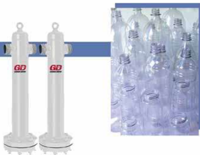
Grades C & E