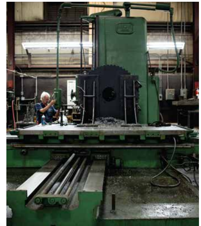
JBS Boring Mill