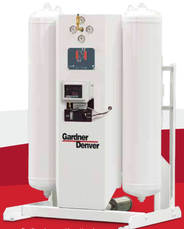
Purifier shown with optional Carbon Monoxide Monitor